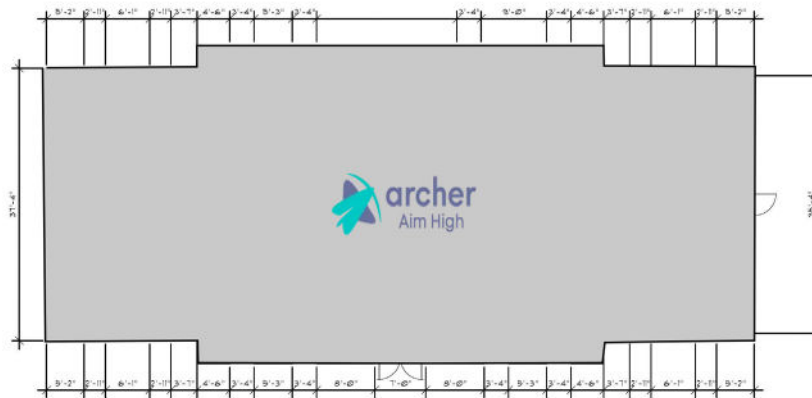
2nd Floor 3,350 sf Leased